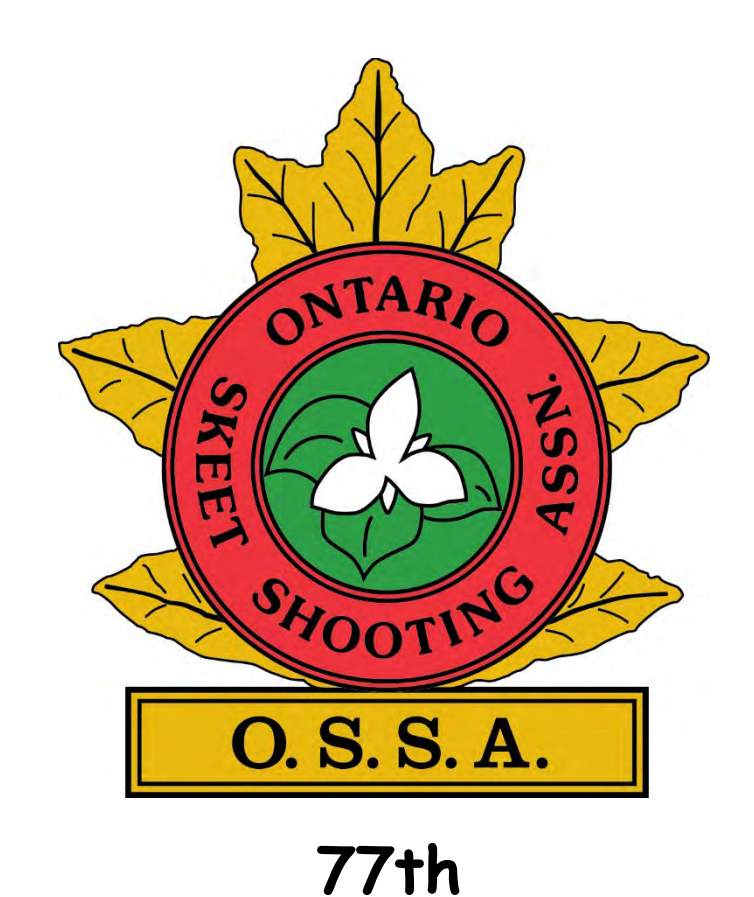
PROVINCE OF ONTARIO OPEN AND CLOSED SKEET CHAMPIONSHIPS