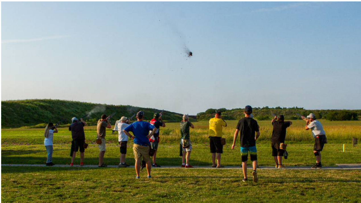
Robbies hat goes up in dust as follow competitors perform the requisite duty of blasting the first one hundred hat to shreds .