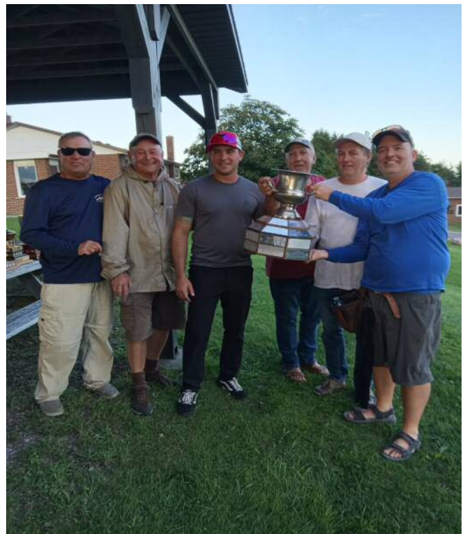
The Challenge Cup goes to the Ottawa Team