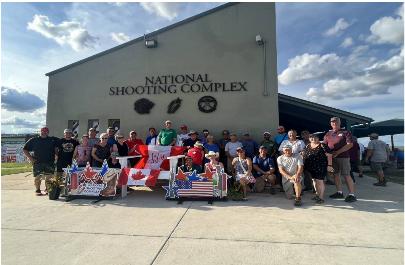
Canadian Contingent at The Worlds